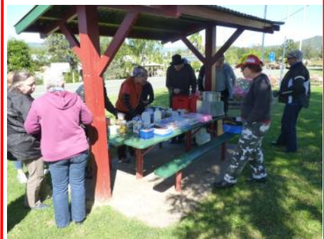
Another wonderful morning tea break on the over the hill run - lots of cake, biscuits, and tea and coffee! Some recipes in future newsletters