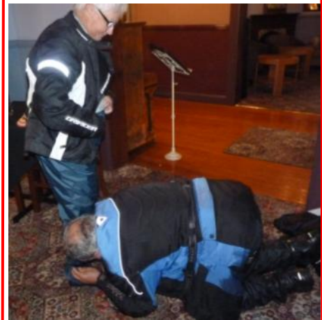
A club member demonstrates the correct method of asking permission of ones partner to go on a run!