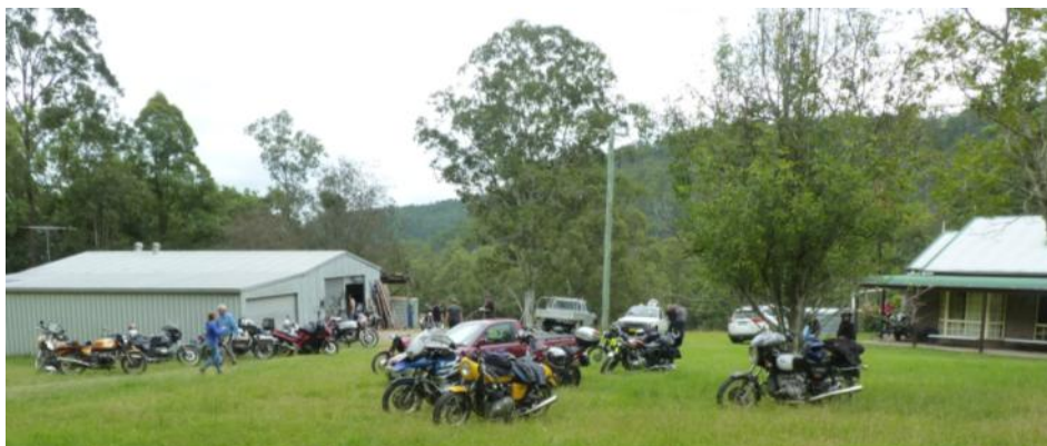
Bottom Right: Shame! A BMW on the backup!