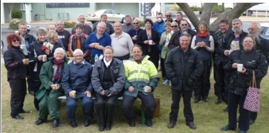
Above: The bulk of the crew - a few missing who had to leave early. And Right: Ready for Day 6 - all rugged up!

We saw lots on the way - a group of 6 flat tankers, and an organic nut oil processing plant at Kingaroy, and a fascinating visit out of Dalby to a gentleman who has built the most extraordinary vehicles, including 2 V-12 powered, and one 18 liter monster built in the style of early 1900s racers. And all in his farm workshop - an self trained engineering genius! Stand by for more pics and details in later issues. Also more pics are available on the gallery section of the website and on facebook.