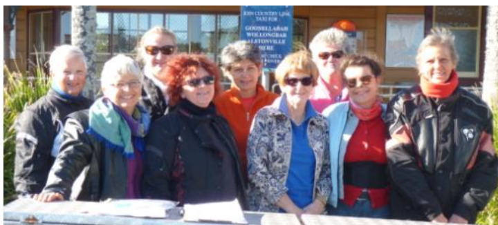
Most of the ladies on the run

Now that I've dried off, washed the bike and completed 3 loads of washing - I can look back on another successful Over The Hill run.. The Run started way back on Sunday 26 April with 12 BMWs and 9 mixed classics., plus 15 pillions and backup vehicle drivers. We headed up to Esk via Rathdowney and Rosewood on day 1 - A challenge for me when my front brakes became unpredictable! All fixed now. The run avoided the main roads wherever possible.