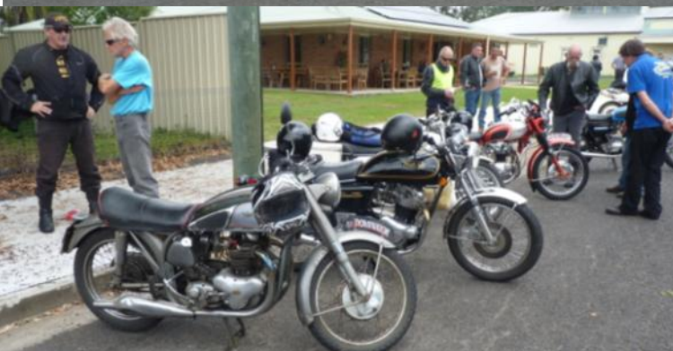
Right below: The Triumph Trophy - beautifully finished.