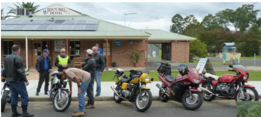
Top: the clubs classics line up

My ride home just missed the rain - a few wet roads, but not a drop on me - very lucky - an excellent run! Only one on the backup trailer, a BMW with a mysterious vanishing spark!!